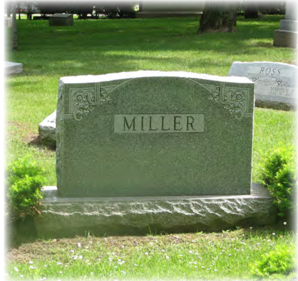
Section G, Block 24, Lot 15

At the turn of the century women's occupations were fairly limited. Rosie the Riveter had yet to be introduced, so the three most common jobs women aspired to were nursing, teaching, and getting married. Of the three, the most respected "profession" was that of housewife/mother, followed by teaching. While nursing was quickly gaining respect, thanks in a great part to the work of Florence Nightingale and Clara Barton, as the 1800s drew to a close it was still largely regarded as an occupation that required little education or intelligence to pursue. Early nurses worked just as hard—if not harder—than those of today, but without the respect that they deserved. Each one of these pioneer medical aides helped clear the way for those currently in the nursing profession.