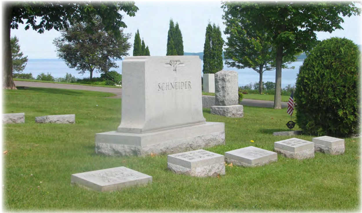
Schneider Lot, Block 144, Lot 5