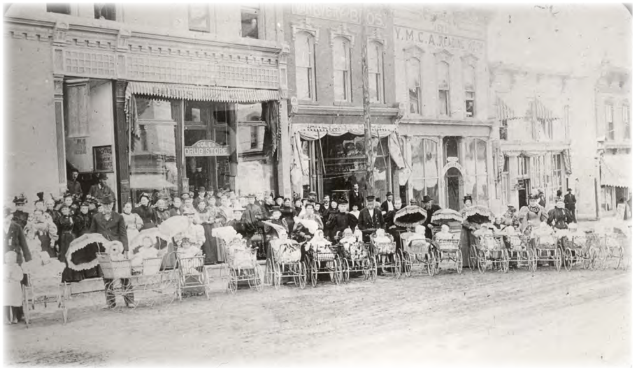
Petoskey's first baby parade, 1891